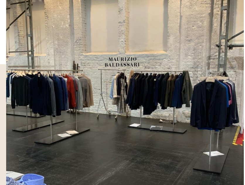
Munich, Amalien Straße 51, Rückgebäude, Germany