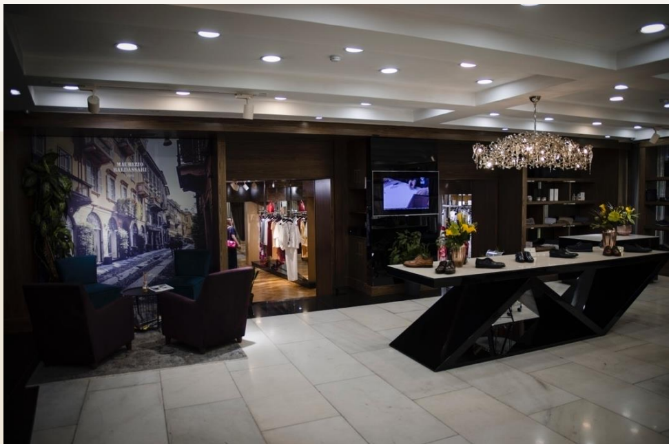
Soft customization by Eletto. Almati, Kazakhstan