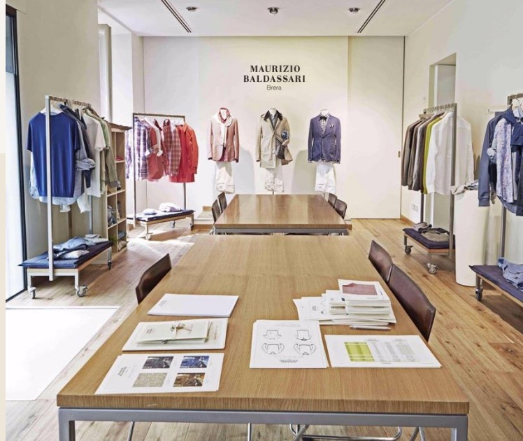
Milano Via Solferino 14, Brera, Milano, Italy