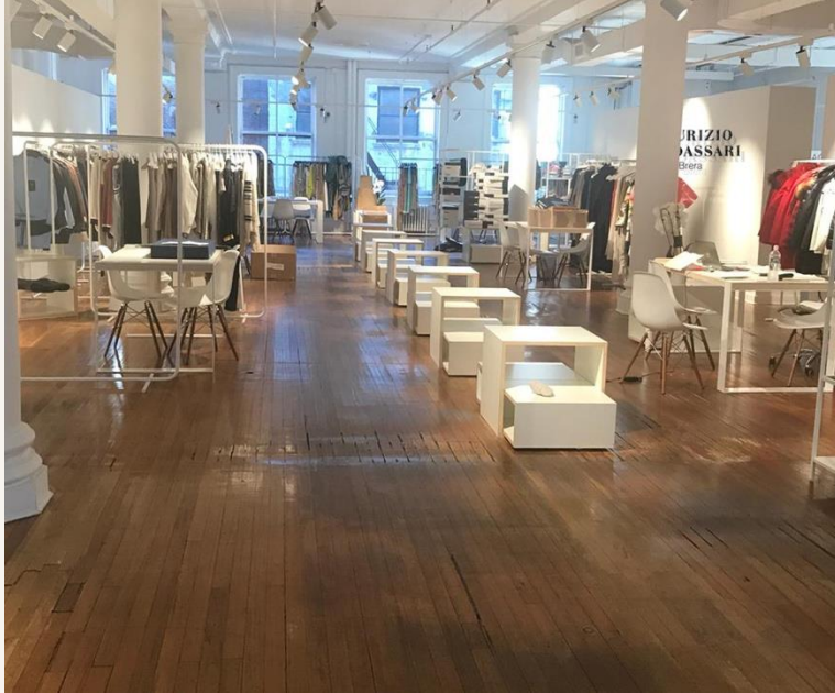
New York 29 E 19th St, NY, USA